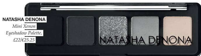
NATASHA DENONA Mini Xenon Eyeshadow Palette, £22/€25.25