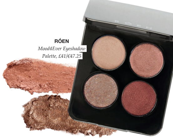
RÓEN Mood4Ever Eyeshadow Palette, £41/€47.25