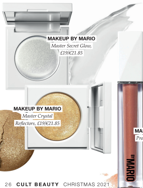
MAKEUP BY MARIO Master Secret Glow, £19/€21.85