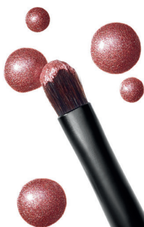
MAKEUP BY MARIO E 5 Brush, £19/€21.85

I always love a little glitz and glamour but especially during the holidays. My Master Metallics Eyeshadow Palette (£41/€47.15) and Master Crystal Reflectors (£19/€21.85) are my go-to for glamming up any look, just pat the reflector onto your lids for instant sparkle.