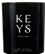
KEYS SOULCARE Sage + Oat Milk Candle, from £35/€38

Switch off from your stresses and strike a soul-soothing ambience with this warm, welcoming aroma.