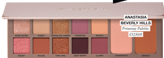
ANASTASIA BEVERLY HILLS Primrose Palette, £52/€60