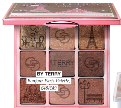
CHARLOTTE TILBURY Instant Eye Palette, £60/€69