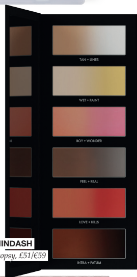
HINDASH Beautopsy, £51/€59

From bold, pigmented colour to gilded glam tones, these are the artistry-led palettes that are staking a claim on our make up collections.