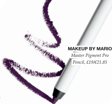
MAKEUP BY MARIO Master Pigment Pro Pencil, £19/€21.85

From a young age, my mom always told me that no matter what, always be a good person and have a good heart.