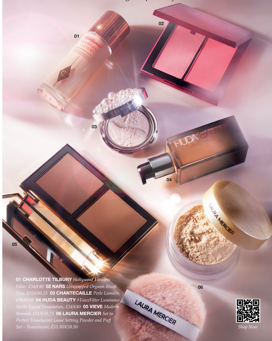
01 CHARLOTTE TILBURY Hollywood Flawless Filter, £34/€40 02 NARS Unwrapped Orgasm Blush Duo, £35/€40.25 03 CHANTECAILLE Perle Lumière, £98/€108 04 HUDA BEAUTY #FauxFilter Luminous Matte Liquid Foundation, £34/€40 05 VIEVE Modern Bronzer, £31/€35.75 06 LAURA MERCIER Set to Perfect Translucent Loose Setting Powder and Puff Set – Translucent, £33.50/€38.50

From bright blush to star-like highlighter, budge-proof setting spray and everything in between, delve into our party-ready edit of fun and hard-working complexion formulas.