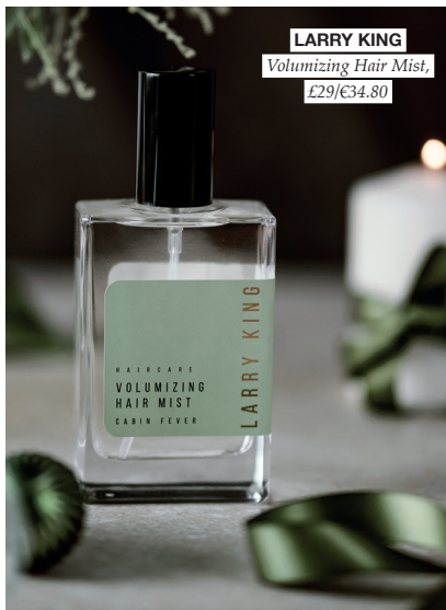
LARRY KING Volumizing Hair Mist, £29/€34.80

It doesn’t end with your make up either — statement strands are all the rage. Movement-heavy styles like the wolf cut, ’70s Farah Fawcett-esque locks and the bigger-the-better ’fros have dominated 2021 with little sign of stopping. Just short of a trip to the salon, look to styling ranges like Bouclème (from £15/€22) and Larry King Hair Care (from £12/€14.40) to emulate your trend of choice with next to no fuss.